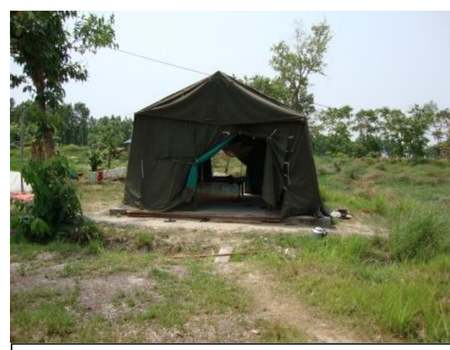
Tent base used for accommodation in Togachhi main cantonment