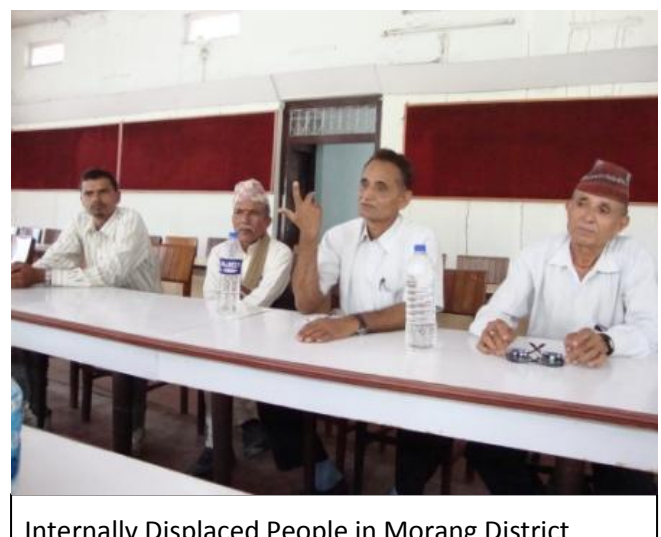
Internally Displaced People in Morang District

The District Administration Offices (DAOs) of Jhapa and Morang districts have already returned the balance amounts to the NPTF. Therefore, this programme will not be operational unless additional budget is reforwarded to these districts. the interactions, the recipients expressed no hassles in receiving these funds from the DAO. However, the current security situation does not encourage many of them to go to original places. All the representatives of martyr's family, conflict affected people (CAP), and disappeared commonly shared that the Government (GoN) should come forward with packages of medium to long term for supporting their scarce livelihood in