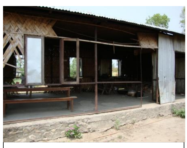
A platoon kitchen in Topgachchhi main cantonment, Jhapa