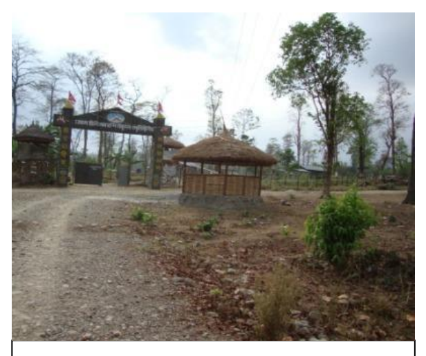
Access Road to Tandi satellite cantonment, Morang

The allowances are distributed regularly to all combatants except for the recent 4 months due to political reasons. Combatants are apprehensive that this blockage is