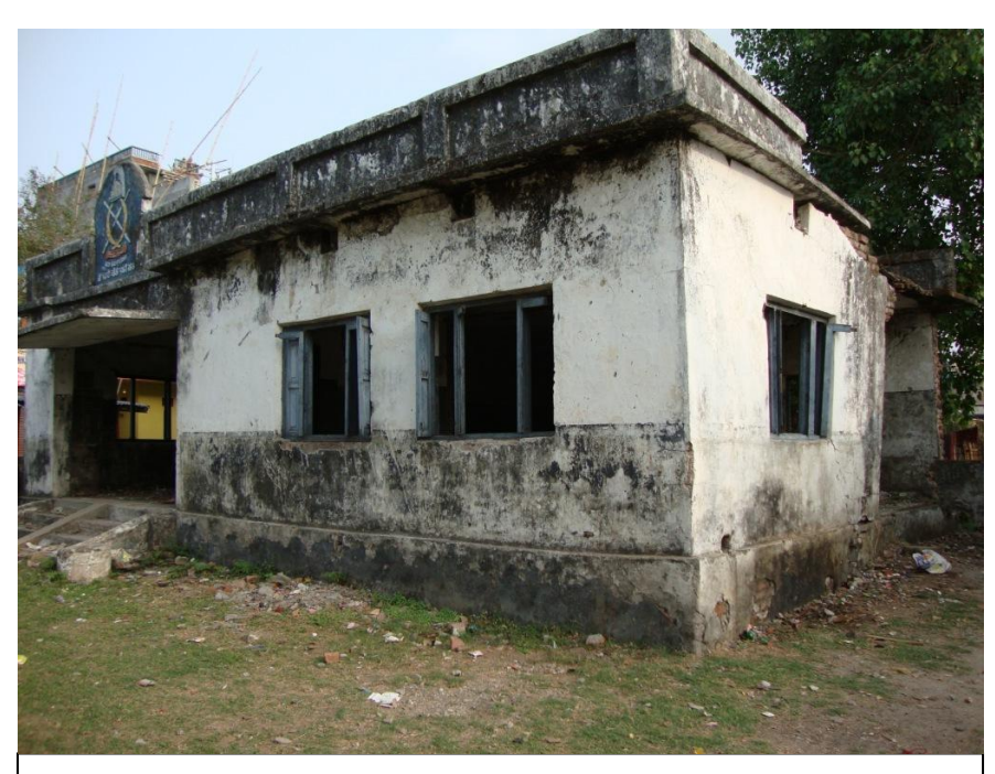
A police post in Pathari, Morang completely destroyed during conflict

The project on reconstruction of police units is progressing well. The reconstruction sites are identified and cost estimates also prepared for each of them in Goldhap, Danabari, Pathari, and Hansh posha. The call for bid is already published for Khanar and that for others will be published during first week of May. It is expected that the reconstruction works will start after а month. Selection of one of the police posts did not meet the project criteria.