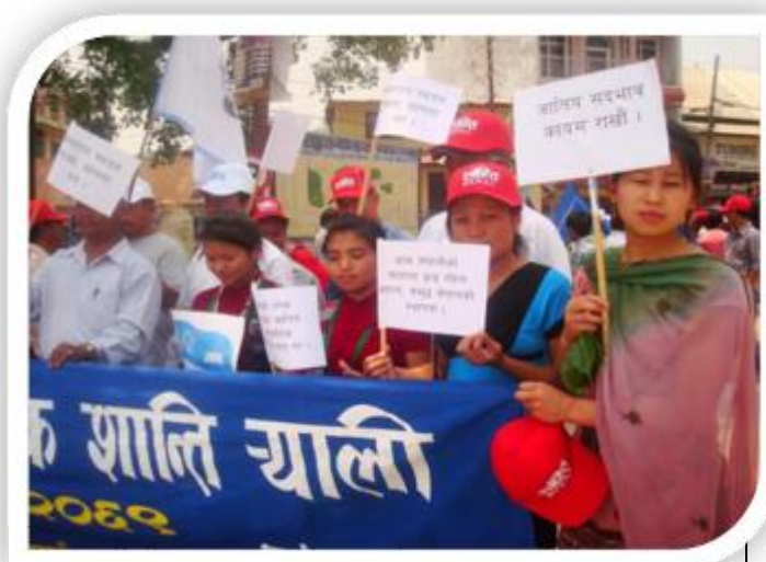
NEFDIN and PBNC.

The project on “Peace Building through Dialogue on Indigenous Nationalities Rights”, being implemented by NEFDIN has completed its plan of conducting 30 peace rallies, 10 district level peace building workshops, 25 district level round table dialogues, and 4 types of awareness raising materials. A few of the other activities like street drama, bilateral dialogue program, PBNC training and orientation, multilateral dialogue program and final evolution are continuing and will be completed before the closing of project in the next trimester. Limited resource allocated to strengthening Peace Building Network Committee (PBNC) was found as a major challenge in this project that had weakened the roles of PBNCs in peace promotion. Based on recommendations made to orient them and strengthen them further, PBNCs were oriented and supported to conduct the district level bilateral dialogue programs.