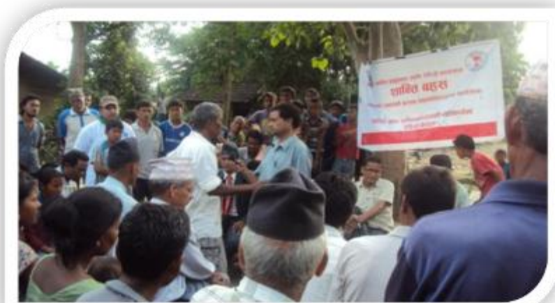
“Peace Debate” programme organized by Radio Nepal as a part of peace promotion activities in Kailali district.

Radio Nepal, in its last trimester of the project on “Peace Promotion through Radio” has met its initial targets and produced and broadcasted 52 episodes each of peace drama, peace debates from 17 conflict affected districts, and peace report. Similarly, it has produced and broadcasted 4 Public Service Announcements (PSAs) and two songs. 2000 brochures and 12000 stickers were printed to widely disseminate the information about the project activities.