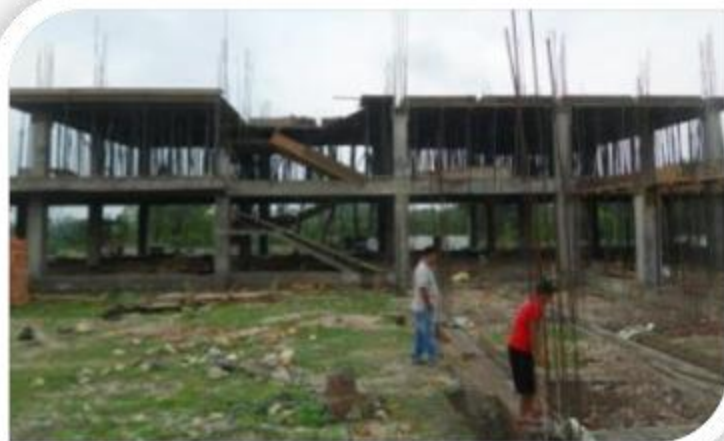
Construction work of Orthotics/Prosthetics Unit at BPKIHS.

Two projects on establishing rehabilitation centre for conflict affected people, one at BP Koirala Institute of Health Sciences (BPKIHS), Dharan, and another at National Disability Fund (NDF) have been ongoing. The construction of rehabilitation center at BPKIHS has started and about 50% of the works is completed. Roof slab is casted for ground floor of physiotherapy unit, roof slab is casted up to 2nd floor for Orthotics/Prosthetics Unit and Tie Beam completed for Ramp Construction.