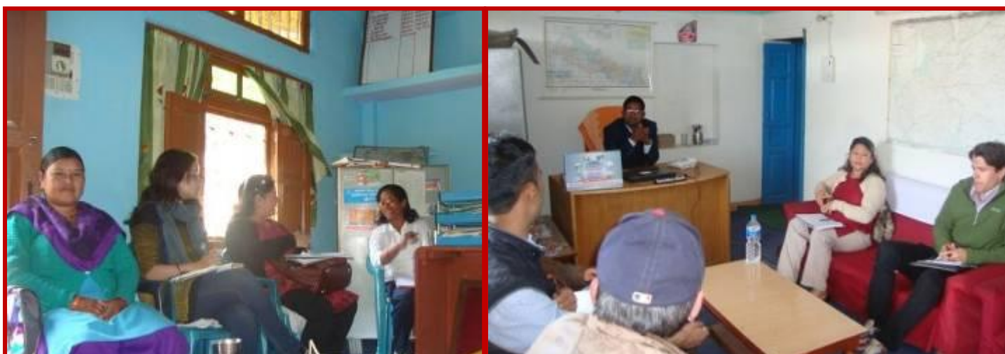
Joint monitoring team visits Women Development Office (left) and District Election Office (right) in Darchula district.